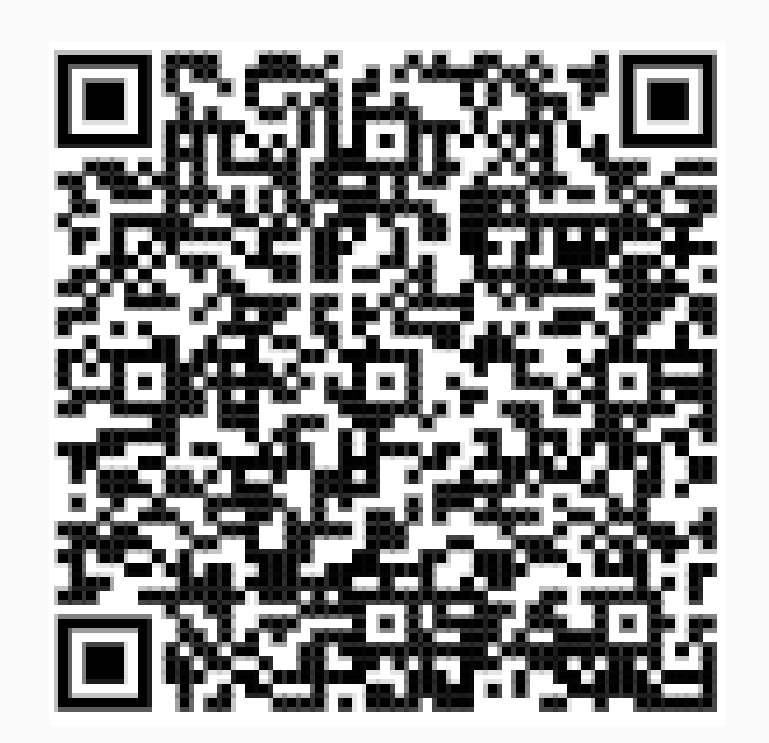
Sanfoundry Blockchain Technology Online Test